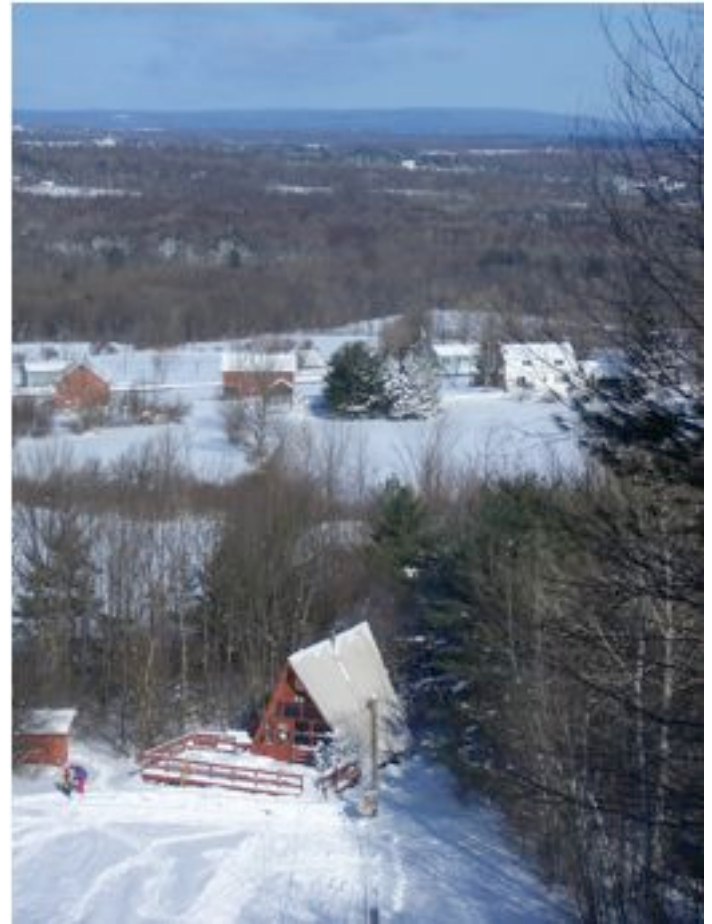
View from the top!!

The town’s appraiser reassessed the property from $10,000 to $162,100!! Finding this excessive, Frank and Ed grieved the assessment with the appraiser, and assessment was then raised to $179,000!!! They completed the NY Real Property Services complaint form and the tax assessment was reduced to $14,000. The tax bill in the fall did not initially reflect this change, but at press time we are back to a fair assessment and tax burden.