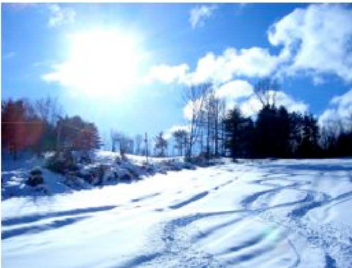
Fresh Powder on the Meadow run!!

Pass information to friends and colleagues: The newsletter and application form is available for download on-line at http://www.skiventure.com