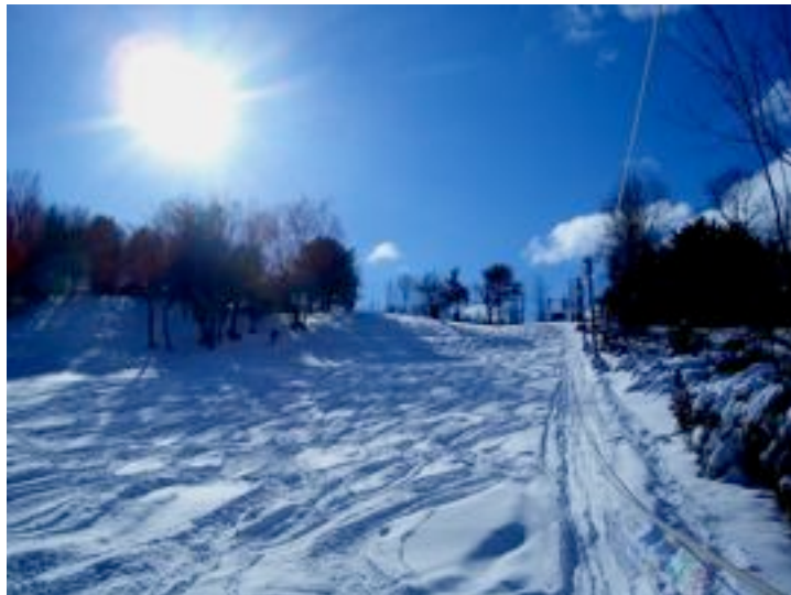
“Local skiing on natural snow”

Ski Venture is back for another year of skiing and riding – this season will be the club’s 70 th year of continuous operation. This makes the club one of the oldest in operation in the country!!